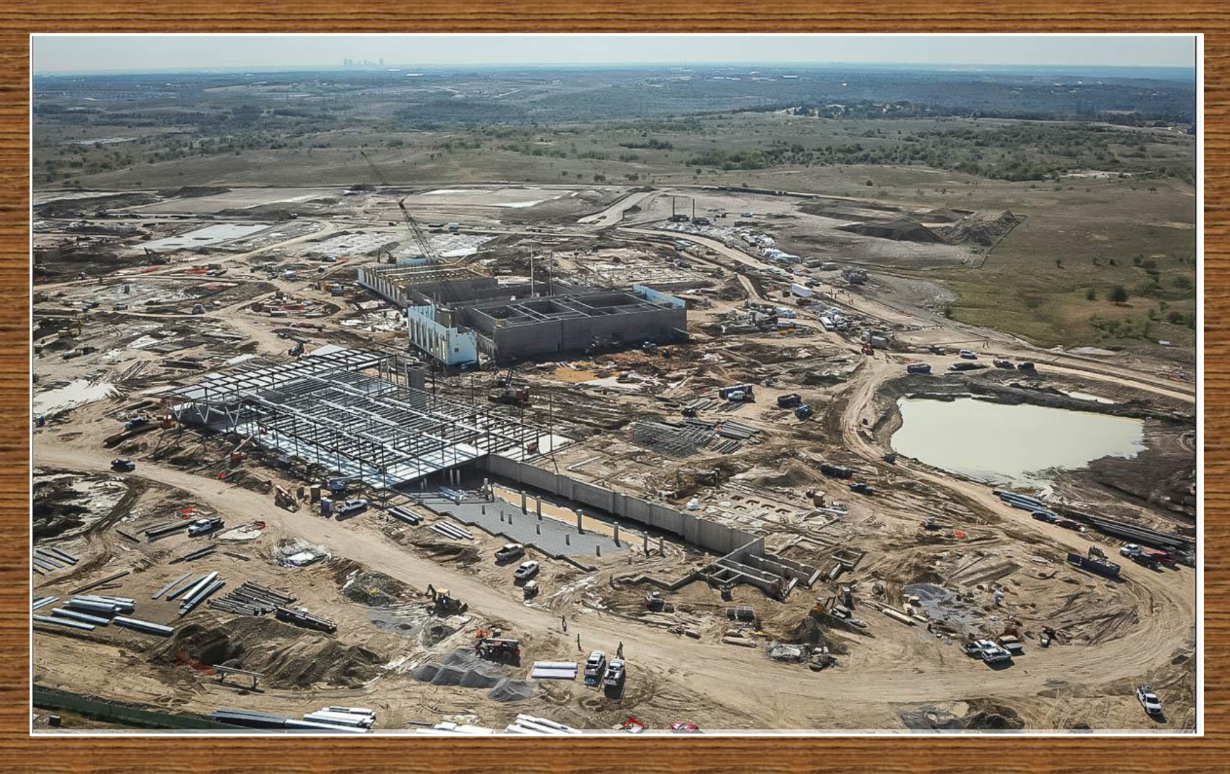
Aerial of the north side of the property