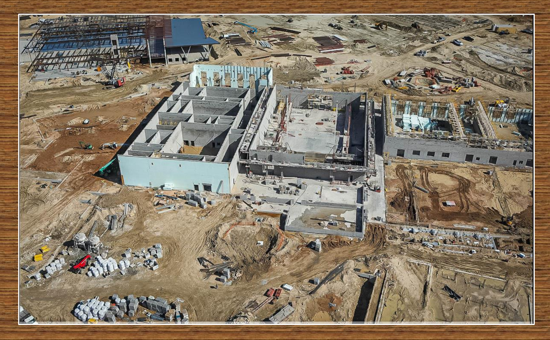
Aerial of fine arts and gymnastics