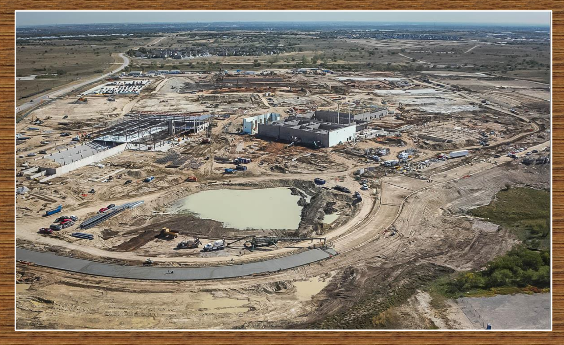
Aerial of the west side of the property