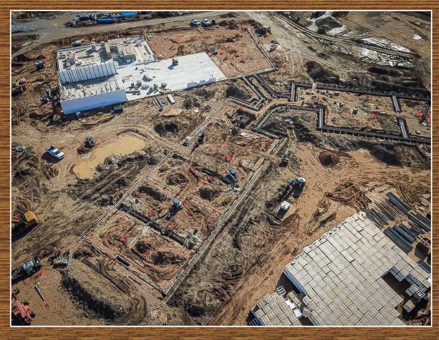
Aerial of property looking south