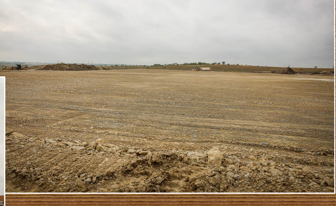
View of the auxiliary field final grade